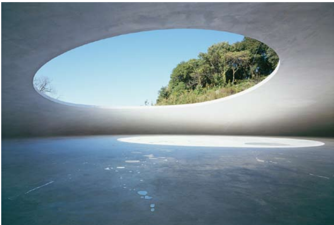
Benesse Art Site

Included in the cost is a visit to Teshima Art Museum and Les Archive du Couer .