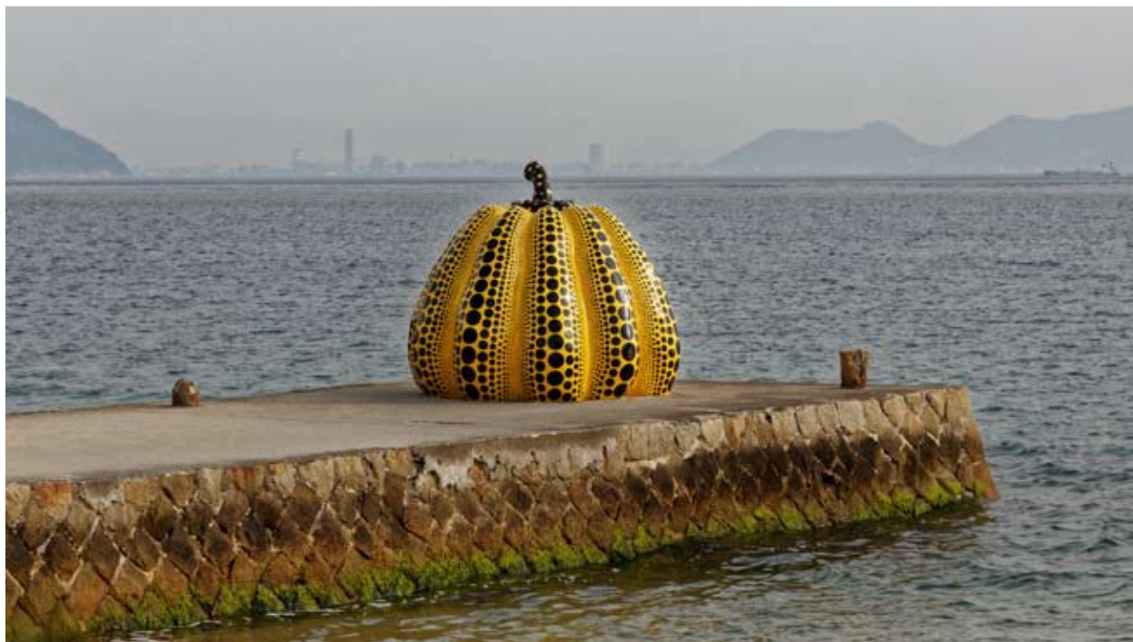
Yayoi Kusama - Pumpkin

Included in the cost is a visit to Benesse Art Site, and one other museum on the island.