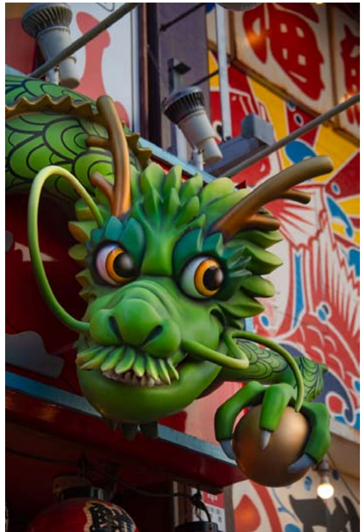
Green Dragon, Osaka