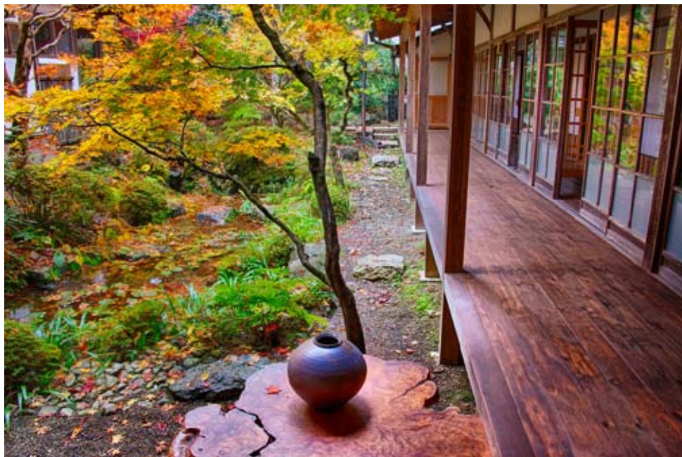
Japanese Monastery Garden

On Your Own: If you are a “fashionista,” a 30-minute taxi ride from Kurishiki is the famous Kojima “ Jeans Street ” which is the birthplace of Japanese denim culture. There is a wide variety of denim and denim-related shops, including sweets and snacks that are colored denim blue. The Momotaro Jeans Kojima Ajino store carries handmade Japanese jeans created with custom hand-loomed denim woven in Kojima.