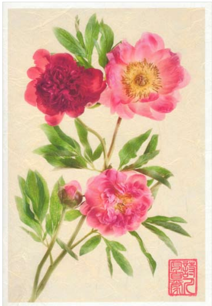
Peonies mon Amour © Harold Davis. Printed on Awagami Unryu washi.

Please Note: After breakfast, our suitcases will be transferred to the hotel in Kurashiki, so we will be without our suitcases overnight. Do keep your photographic gear with you.