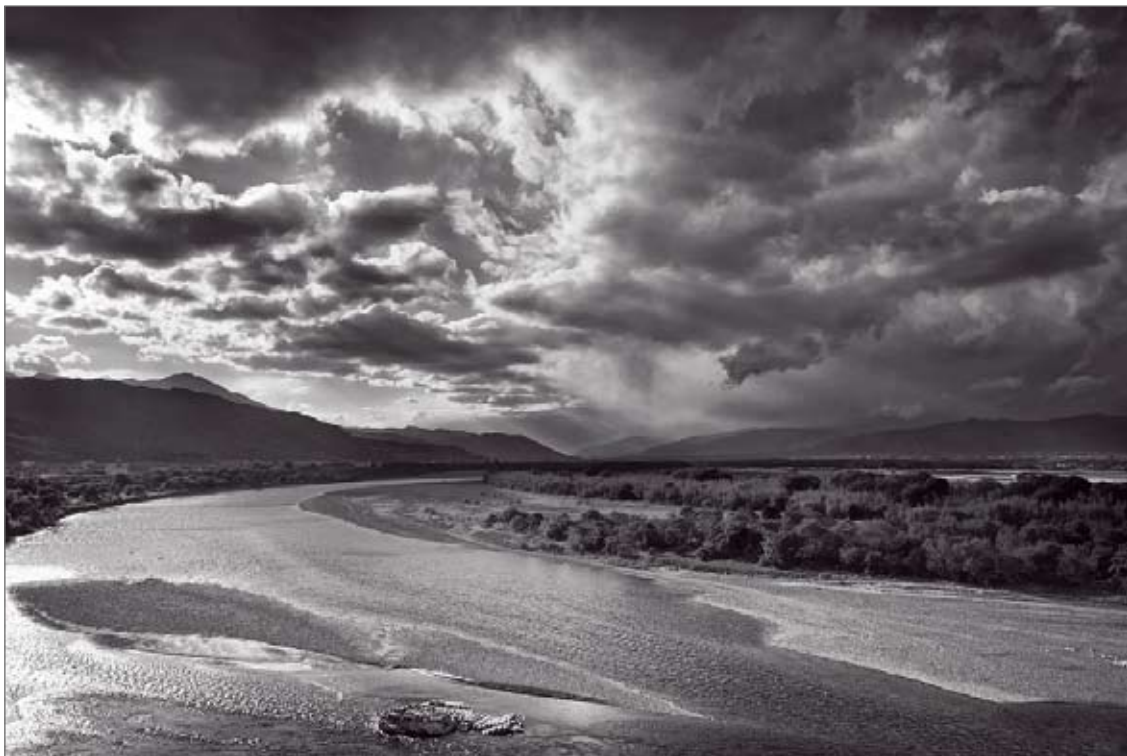
Yoshina River, Shikoku

Today we will travel by private coach across the bridges to Shikoku Island, stopping along the way for an excursion to photograph the Naruto Whirlpools from a boat. This natural phenomenon is caused by tidal water travelling between the Seto Inland Sea and the Pacific Ocean. We will aim to time our journey with the tide to get the best chance to photograph the whirlpools in action. From Naruto, we continue our journey to Shikoku where we visit a few of the 88 temples near Tokushima on the famous pilgrimage route.