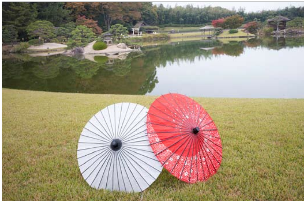
Umbrellas, Korakuen Garden, Okayama

* In the morning before we check out of the Kanazawa Tokyu Hotel, we will give our luggage to a transfer service and see it again in Kyoto on Day 9. Keep your cameras and what you will need overnight with you in a small backpack or bag.