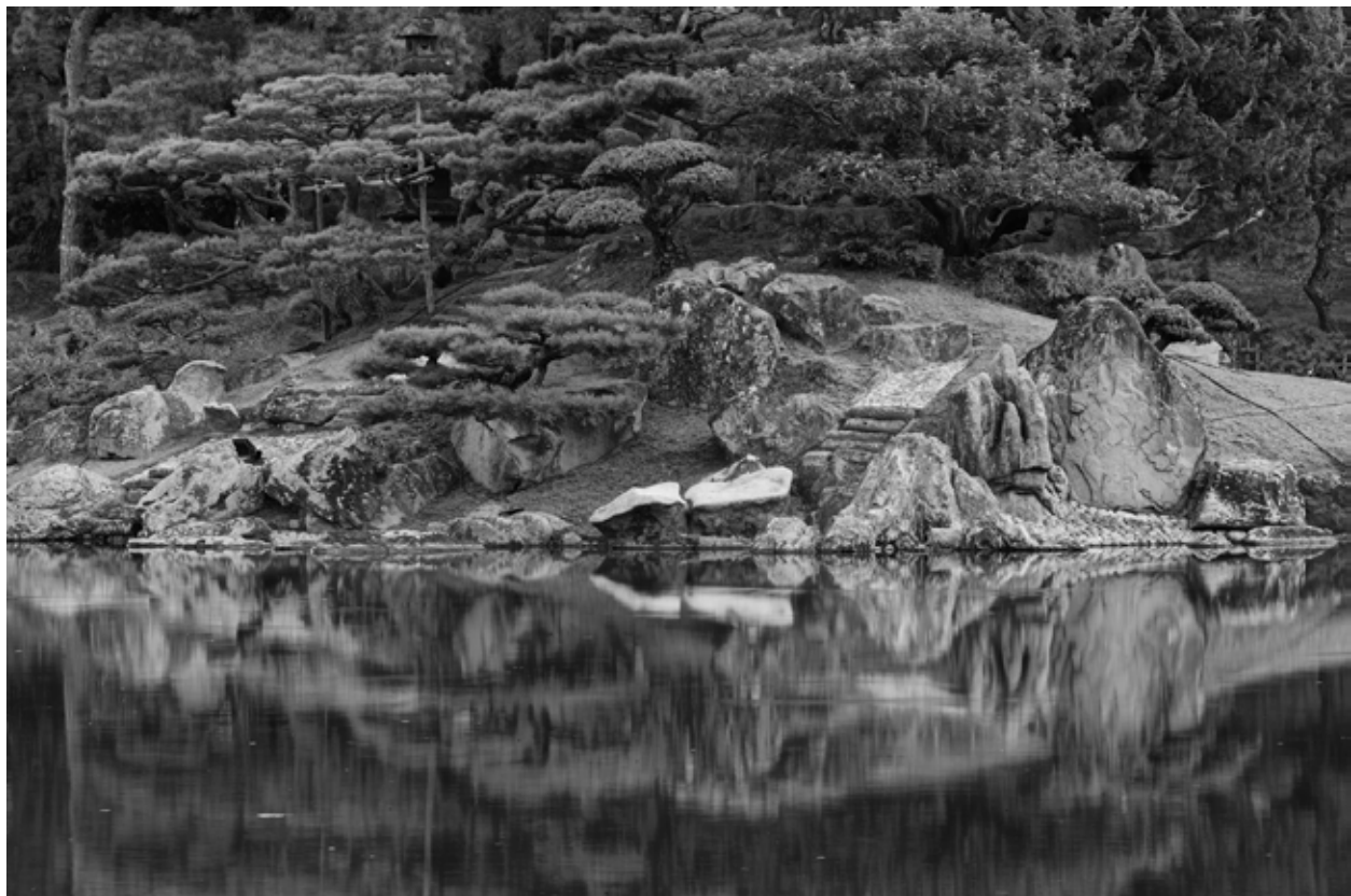
Reflections, Ritsurin Garden

Please consider joining us on this very special trip that will emphasize photography of Japanese gardens, and the incredible culture that has grown up around horticulture in Japan over the ages.