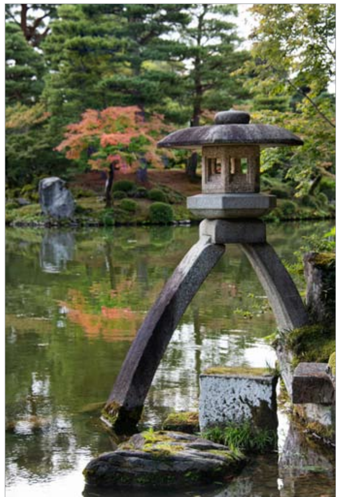
Stone Lantern, Kenrokuen Garden, Kanazawa

* We will be reunited with our luggage at the hotel today.