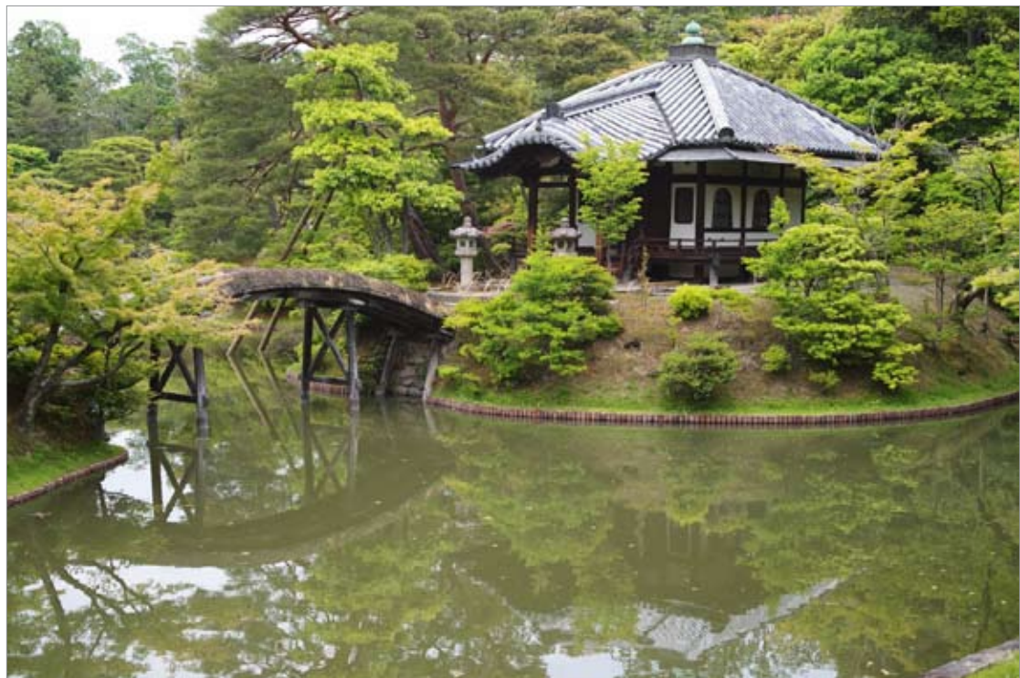
Katsura Imperial Villa Garden, Kyoto

We will be on our own to explore Kyoto in the late afternoon. Enjoy dinner at your leisure.