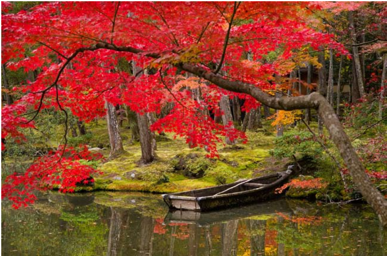
Autumn Red, Saihoji, Kyoto