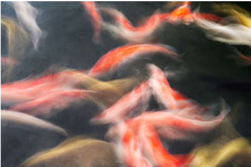
Something Fishy, Ritsurin Garden

Late in the afternoon, we will transfer by train to Kyoto and settle into our hotel home for the next four nights. ✱ We will be reunited with our luggage at the hotel in Kyoto today.