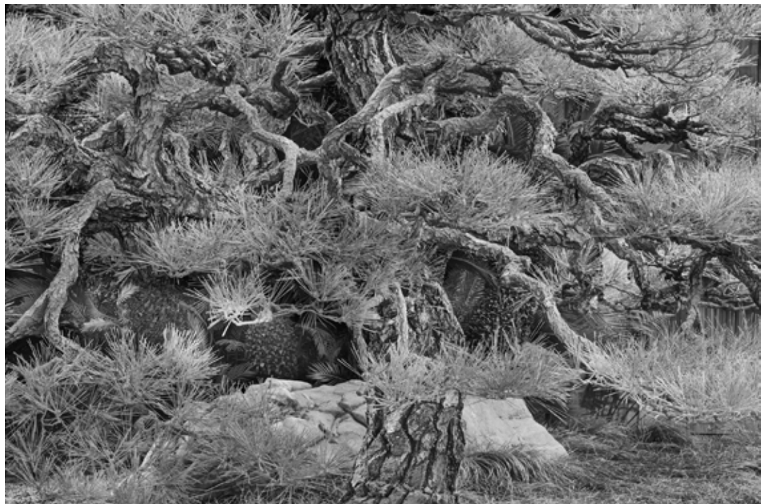
Pine Tree, Ritsuren Garden

Open to the public in 1875, Ritsurin Garden is one of the largest strolling gardens in Japan and the only three-star Michelin rated garden in Japan. The garden is known for its ippo ikkei (new view with every step) design. In 1953, the Japanese government designated the garden as a Special Place of Scenic Beauty.