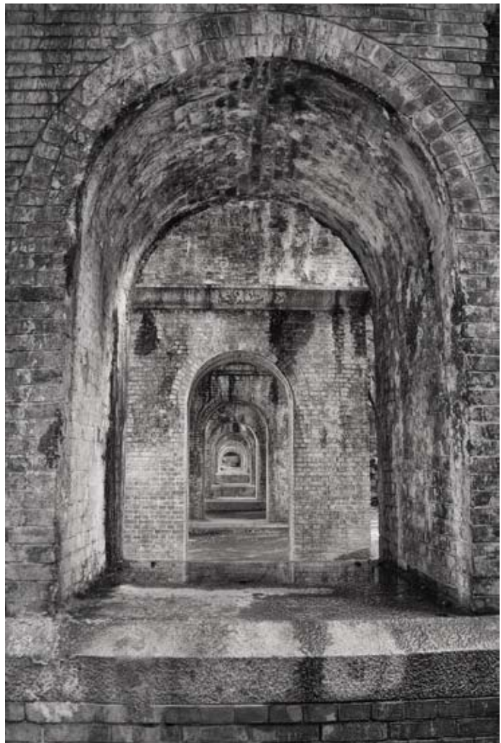
Under the Aqueduct at Nanzen-ji

Enjoy the rest of the afternoon exploring on your own before rejoining the group for our festive Farewell Dinner.