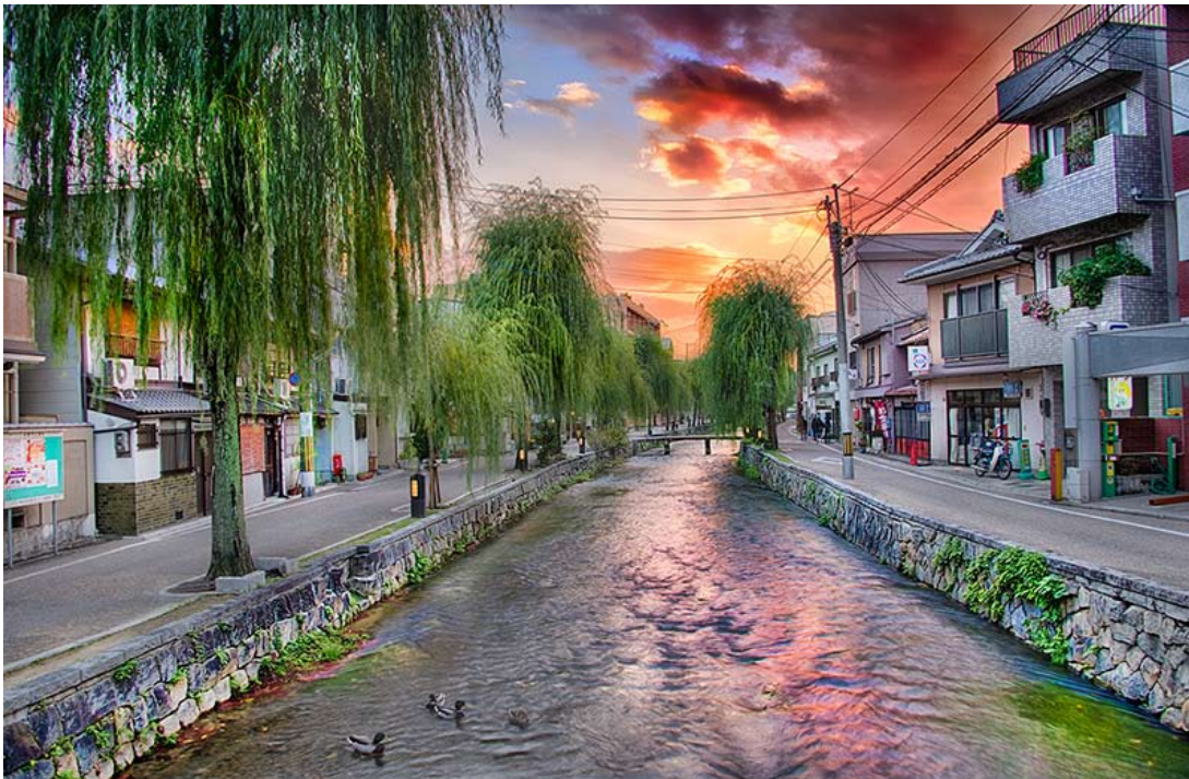
Shirakawa River, Kyoto

Most meals will be Japanese cuisine. If you have any food restrictions, please be sure to note that on the Reservation Form . Alcoholic drinks are not included in the cost of the tour. Tips are not generally expected in Japan.