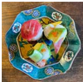
Harold's Kanazawa Sushi

In the evening, we will enjoy a hands-on sushi-making class with plentiful fresh ingredients. This is a unique opportunity to make one's own art before eating it for dinner!